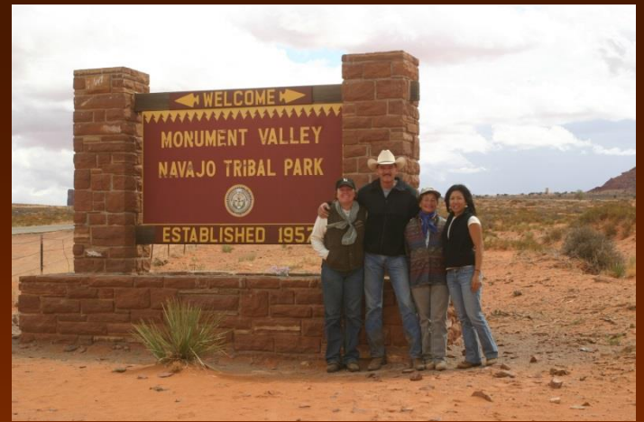
Corral 22 Monument Valley, AZ