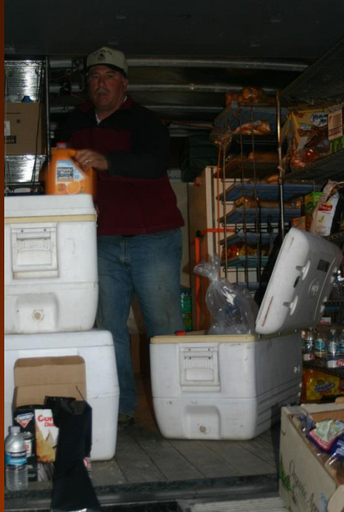
ETI Death Valley 49ers Ride, Cook Crew and Supply Trailer