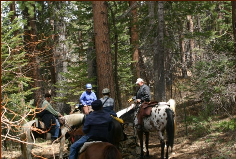
Trail Blazers in Big Bear, CA