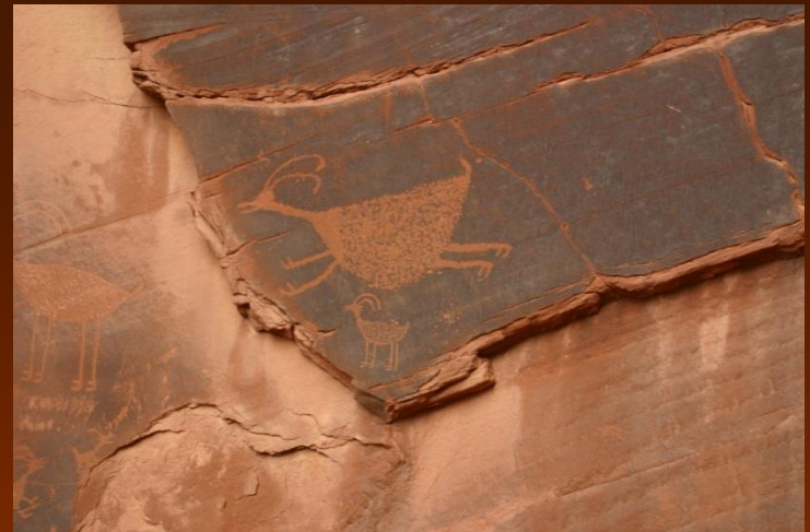
Petroglyph Monument Valley, AZ