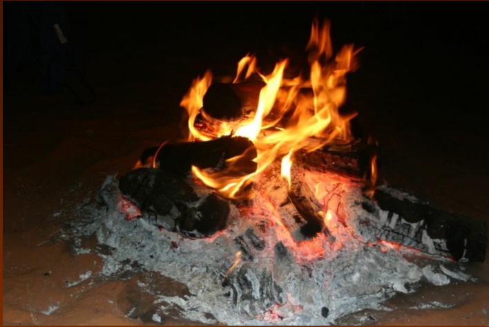
Just a warm campfire in some camp