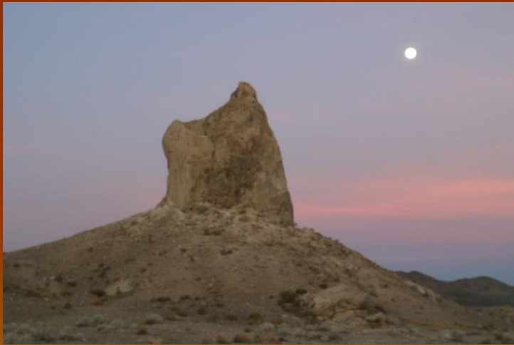
ETI Death Valley 49ers Ride, Pinnacles, Sunrise and Moon Set