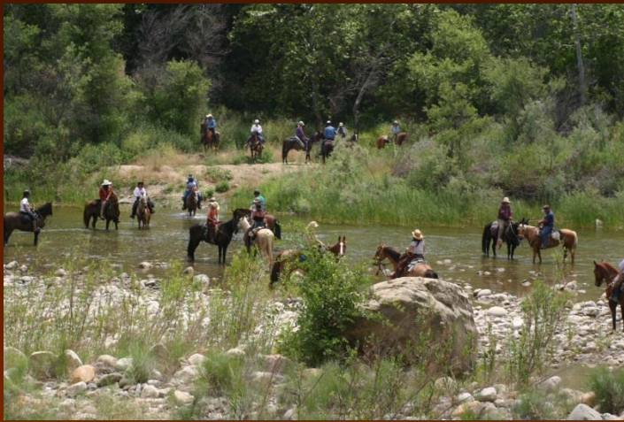
ETI Spring Ride White Oak Camp Rancho Oso, CA