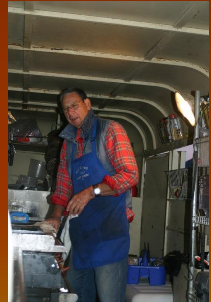
ETI Death Valley 49ers Ride, Cook Crew and Cook Shack