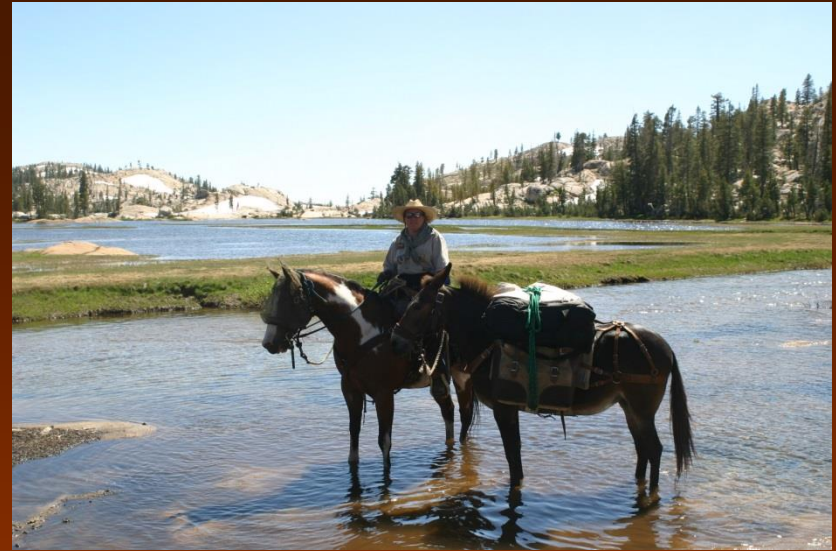
Back Country Horsemen of California, Mid Valley Unit, Educational Pack Trip Emigrant Wilderness area, CA