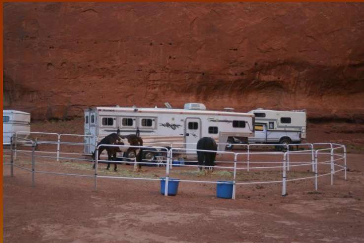
Monument Valley, AZ. Thunderbird Canyon Camp