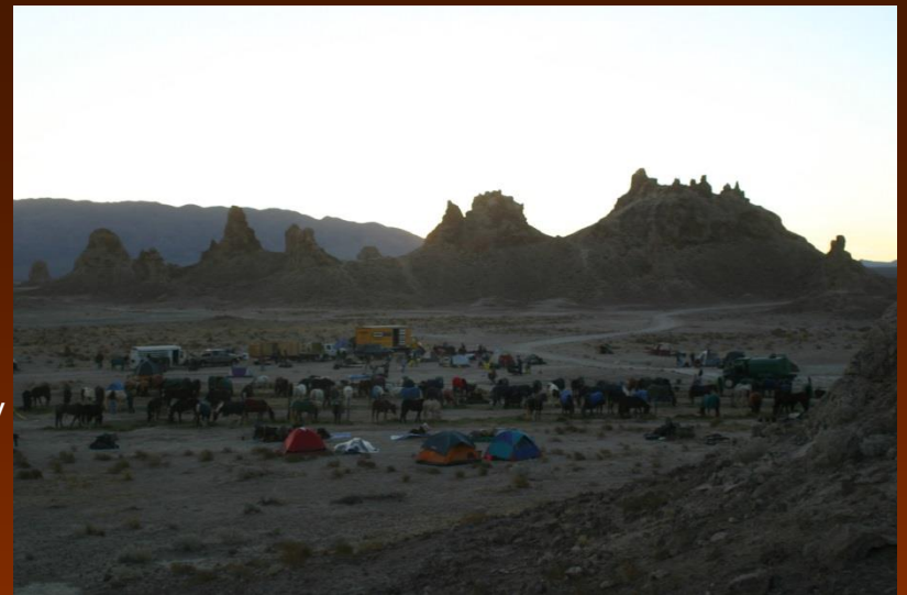
ETI Death Valley 49ers Ride Camp at the Pinnacles