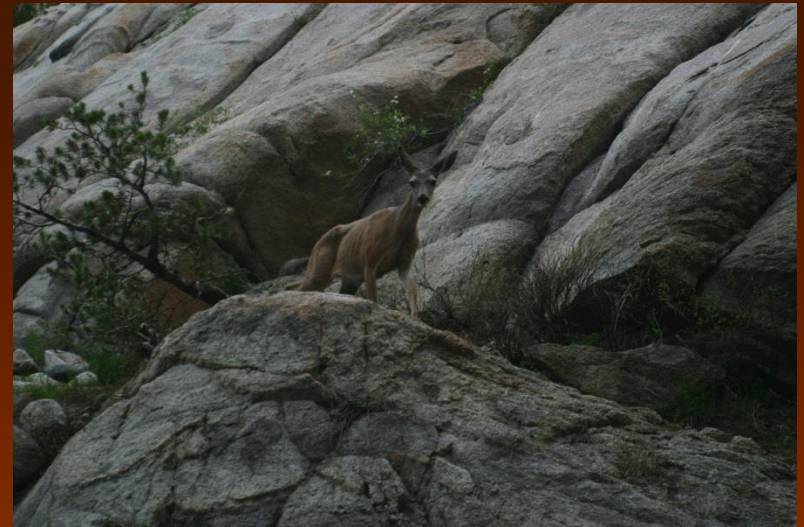
Bucks Lake, Emigrant Wilderness, CA Deer walking through Camp