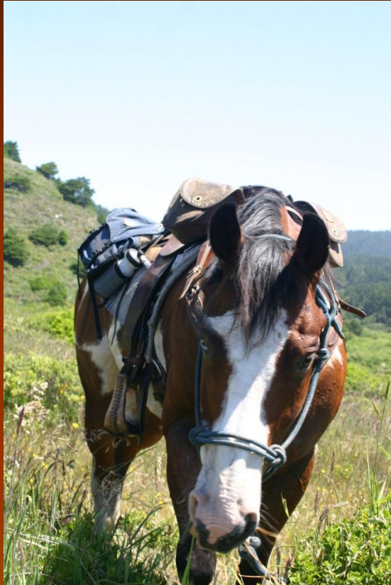
“GT” at ETI Spring Ride Pt. Reyes, CA