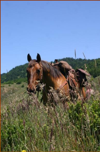
“Sarg” at ETI Spring Ride Pt Reyes, CA

Before loading your equine pal into the trailer to go camping there are a few key points in training that are essential for a safe camping adventure with you and your horse.